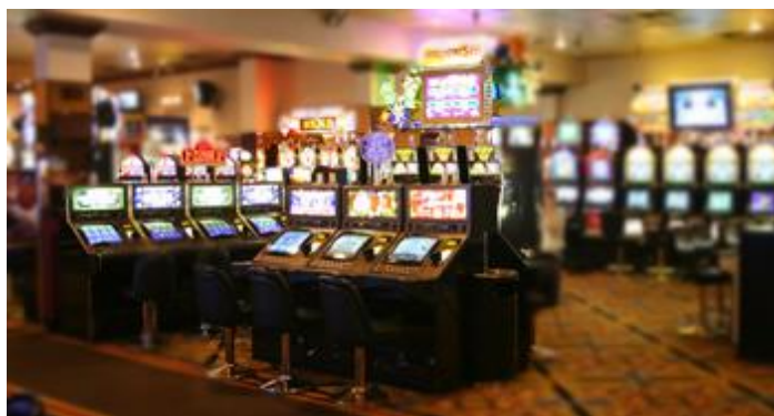
Casino floor features slots, Blackjack, Roulette and Craps