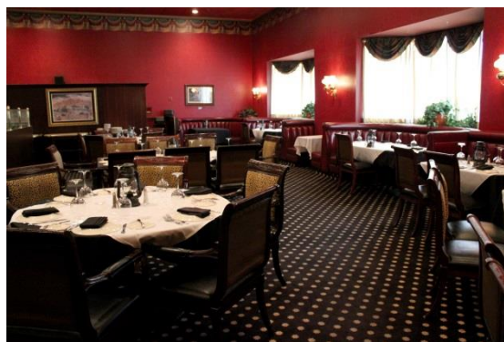
The Steakhouse at the Pass features superb cuisine